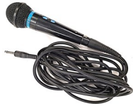
Microphone & Cable