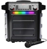
Explorer Outback System